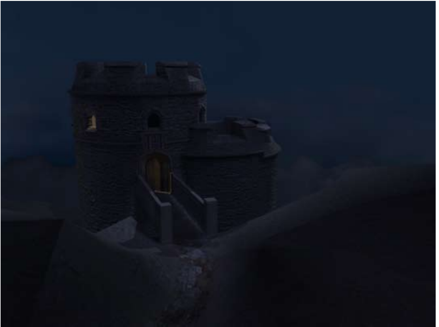
Castle - night

Software: Maya, Photoshop, Gimp, and After Effects