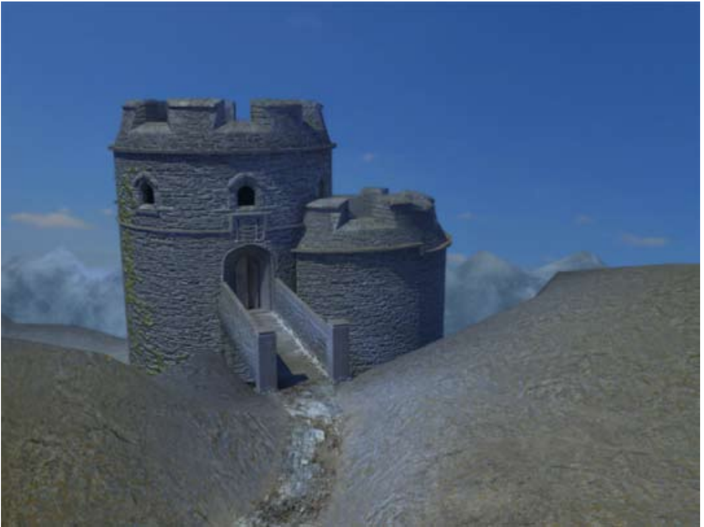
Castle - day

Software: Maya, Photoshop, Gimp, and After Effects